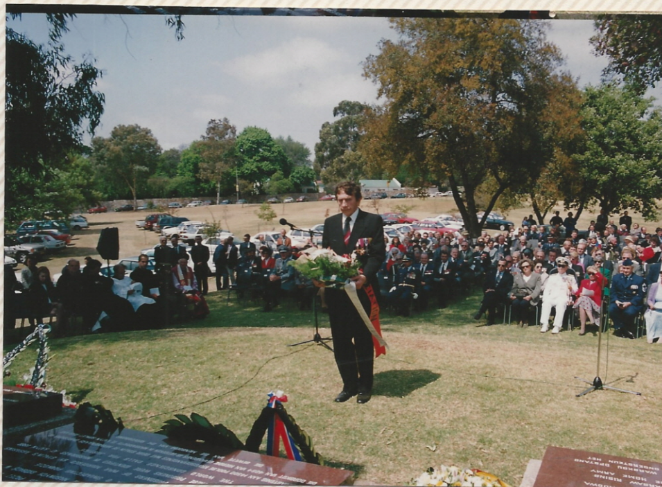
POLISH COMBATANTS ASSOCIATION & POLISH ASSOCIATION CAPE TOWN