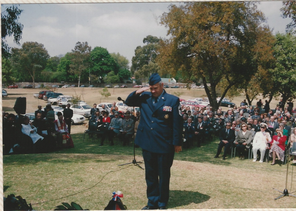
REPRESENTING US DEFENCE ATTACHE