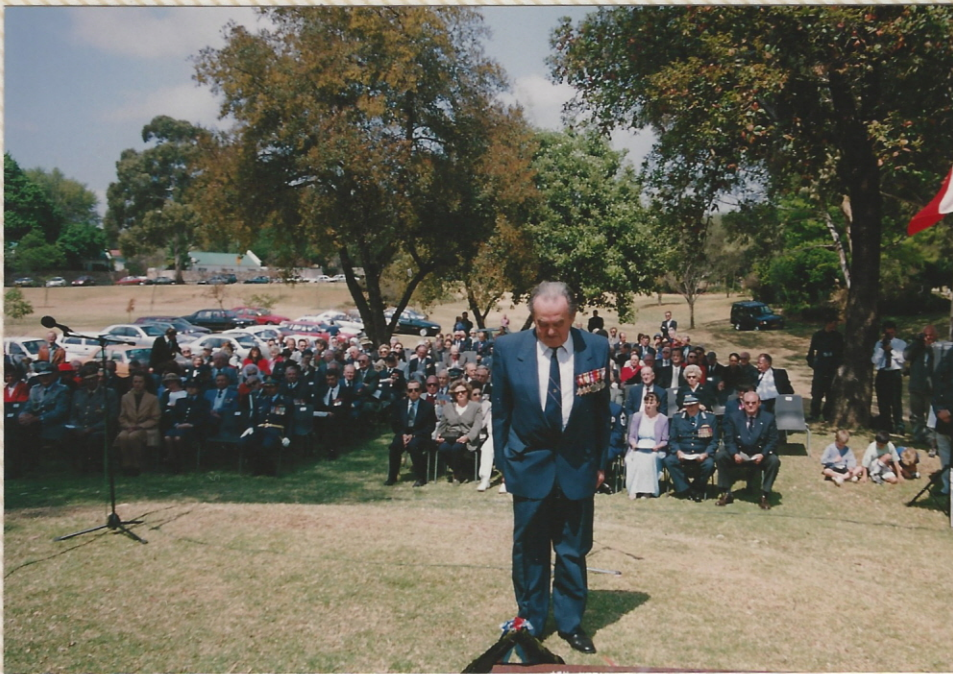
34 SQUADRON, S.A. AIR FORCE