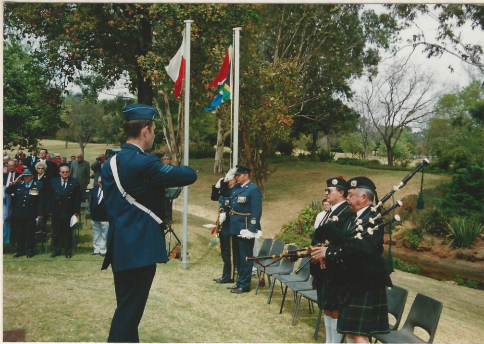
National Anthems. (South - African and Polish).