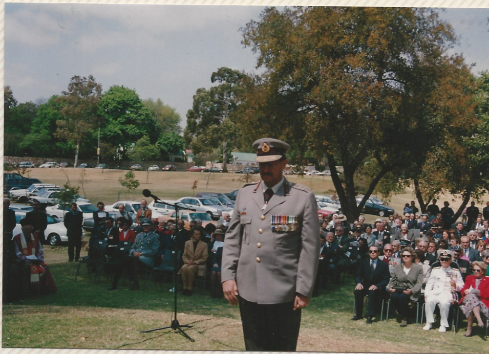
SOUTH AFRICAN MEDICAL FORCE