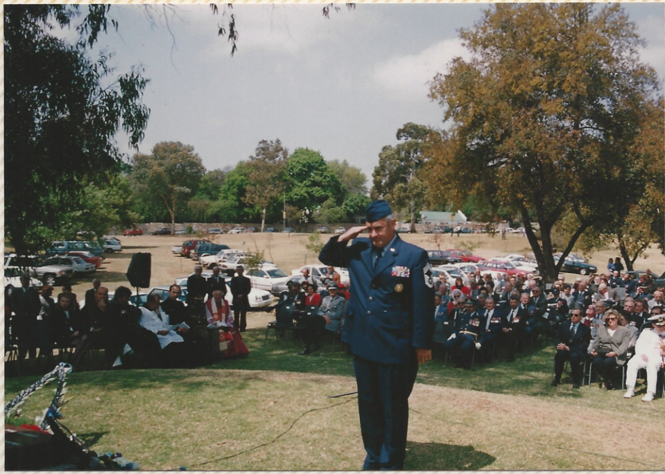
148 SQADRON, ROYAL AIR FORCE