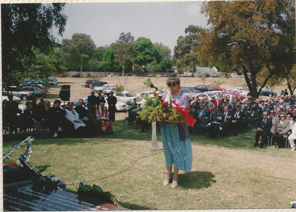
POLISH COUNCIL IN SOUTH AFRICA