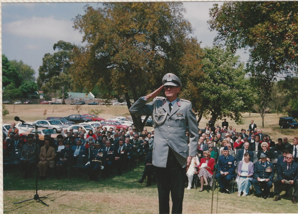
GERMAN AIR FORCE ATTACHE