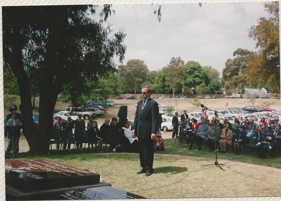
Wreath-Laying ceremony commences . .