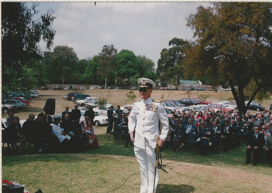
SOUTH AFRICAN NAVY