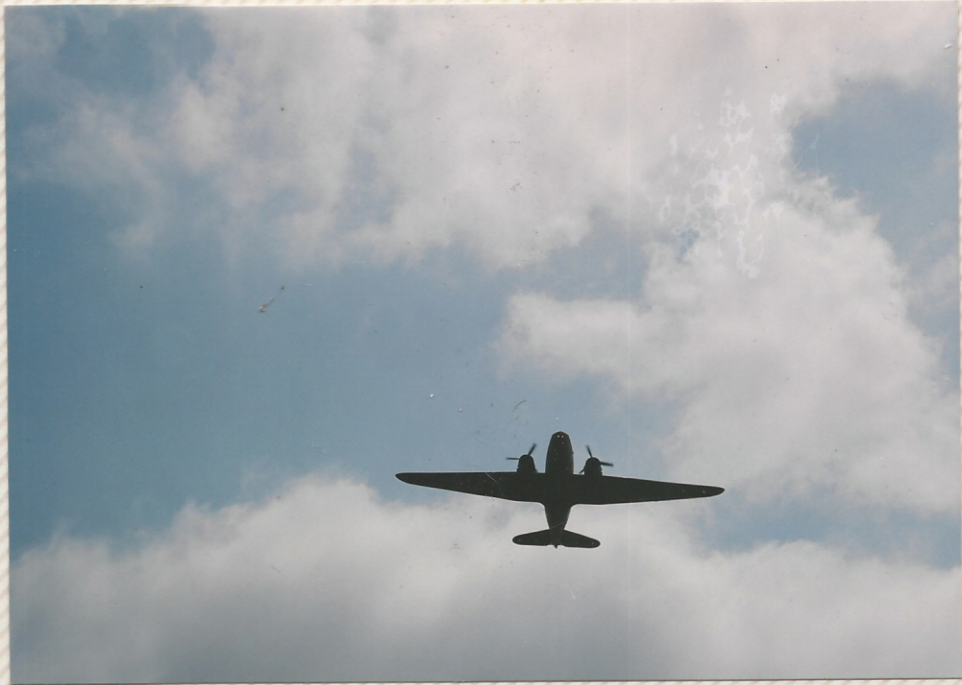
Flypast of SAAF Aircraft.