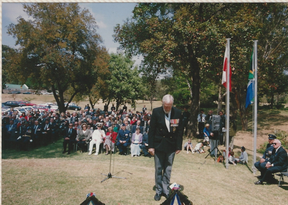
178 SQUADRON RAF