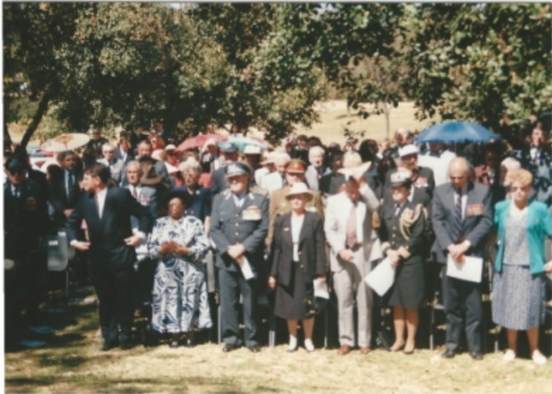
Group photo of the dignitaries at the ceremony