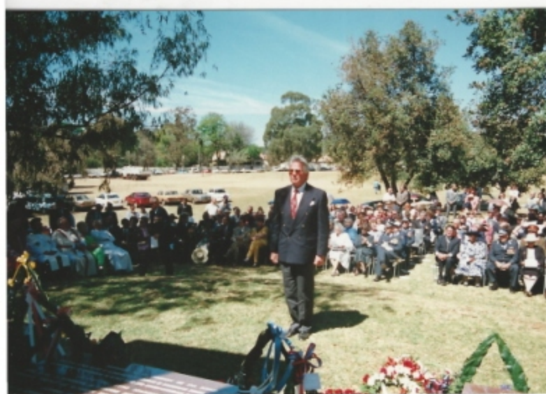
Mr. [Name] speaking at the ceremony